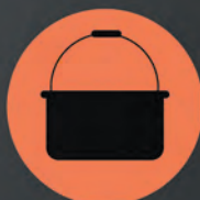
CAST IRON STEWING POT HOOK