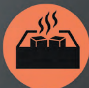
CHARCOAL STARTER TRAY