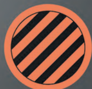
NICKEL PLATED GRILL