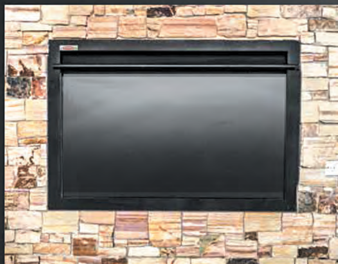
Pictured: Jetmaster built in BBQ & outdoor fire with closed door